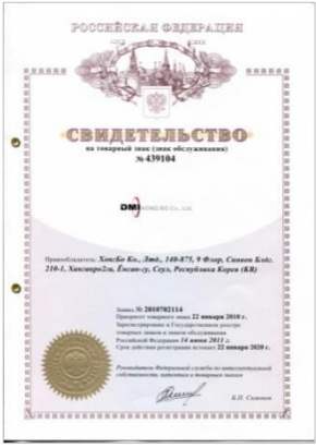
Trade mark registration certificates