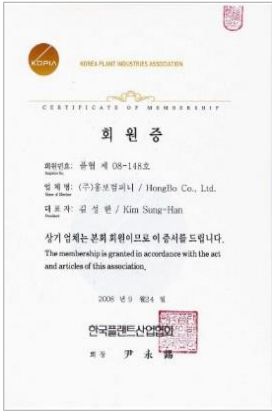
KOPIA Member certificates