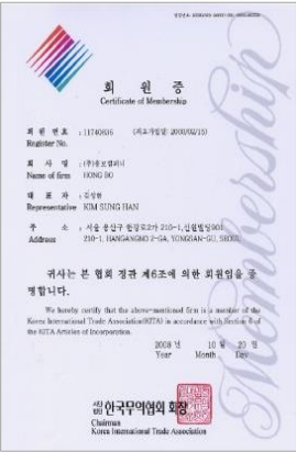
KITA registration certificates