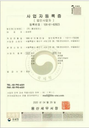
Company state registration certificates