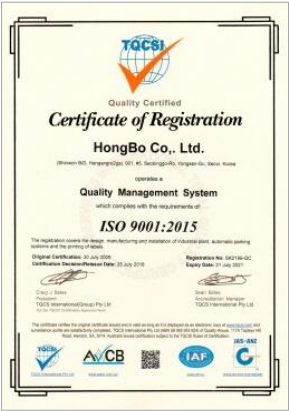
ISO registration certificates